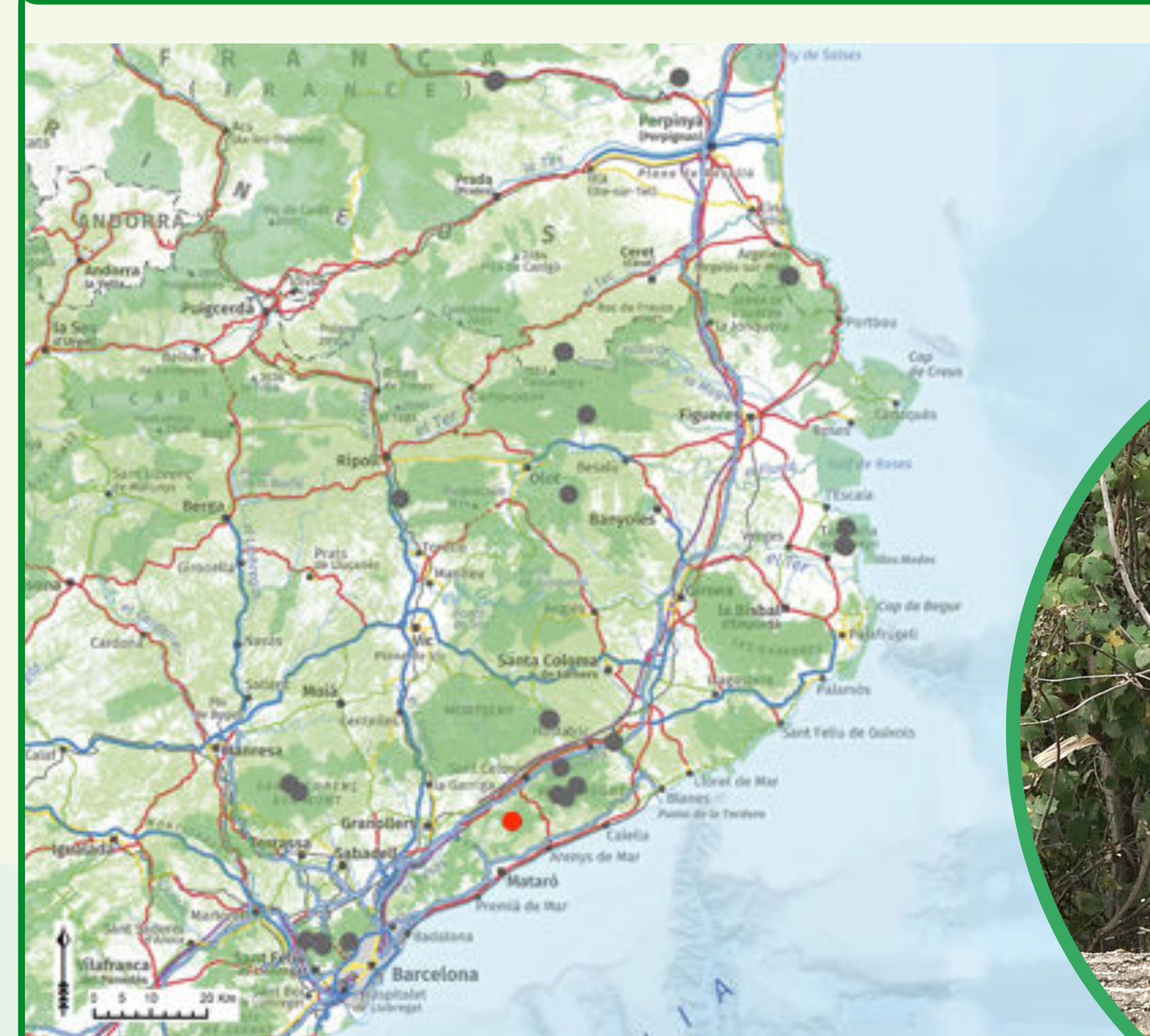
Location of demonstration stand "Can Bosc" (red) and the rest of the project stands (grey) within the Natura 2000 Network.